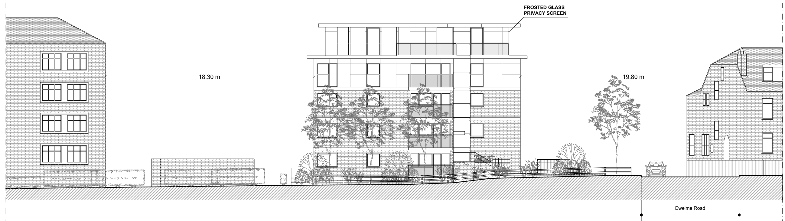
Street Elevation - Devonshire Road